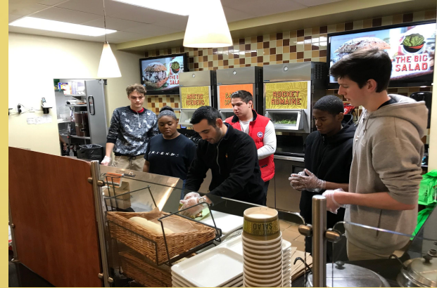
The Big Salad Project