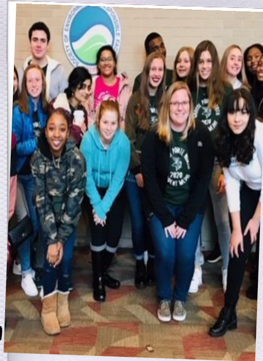
MIPA Fall Conference